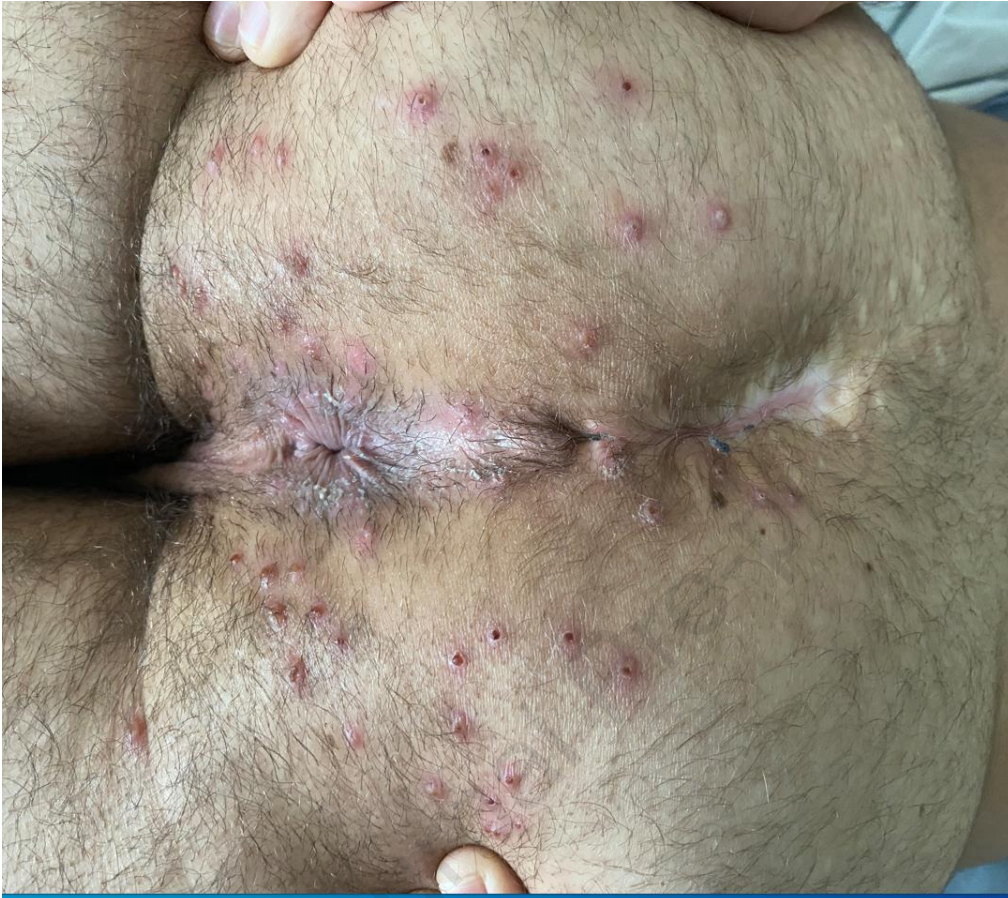
Figure 2 Pustular and vesicular rash in the ano-genital area and on the buttocks in a young MSM with Monkeypox