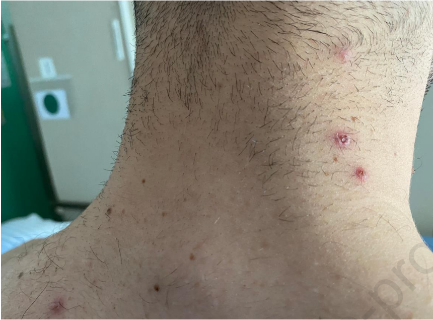
Figure 1 Pustular lesions with umbilicate aspect on the neck in a young MSM with Monkeypox